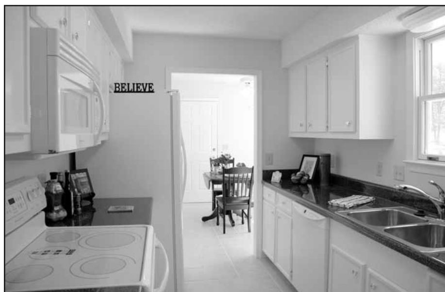
DaySpring model home kitchen