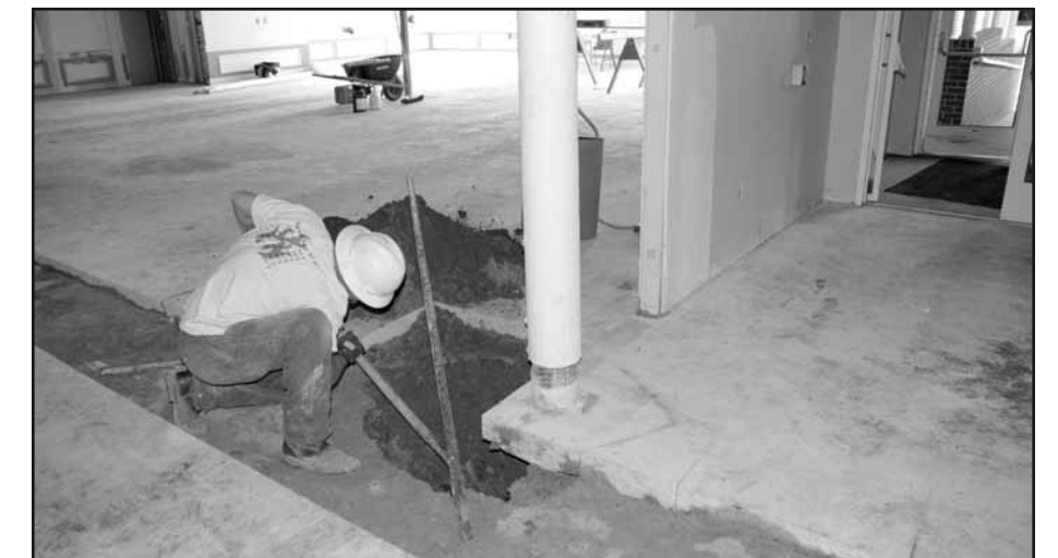
Two-foot trench cut into concrete provides utilities for the new Dining Room and Pub

Residents, families, volunteers, staff and other interested parties are