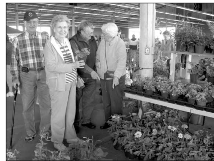
Residents enjoy the beautiful variety of plants and flowers at this year's Midland's Plant and Flower Festival