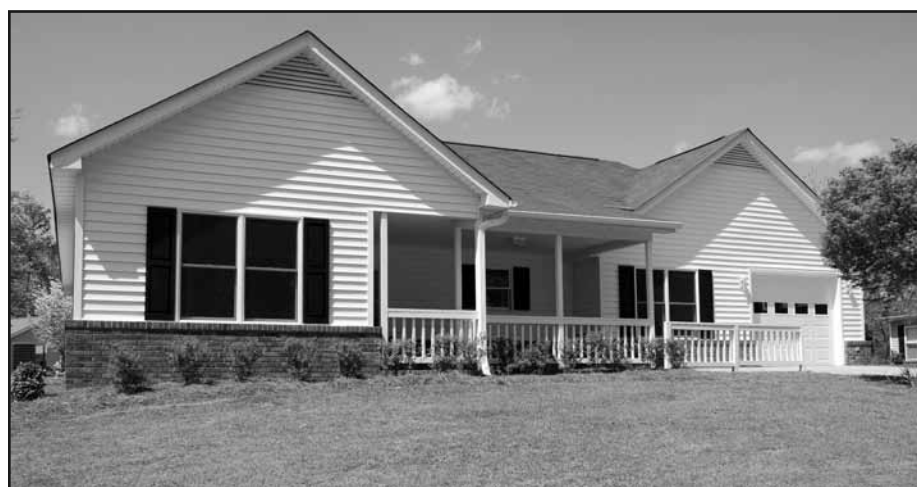
DaySpring model home at the Heritage at Lowman

Nothing beats seeing the campus with your own eyes! We look forward to seeing you at the Open House and Tour of Homes in June!